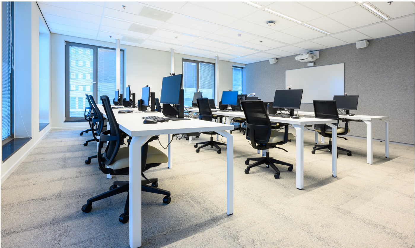
The same attention to ergonomics and seating comfort was given in the work, learning and breakout areas.