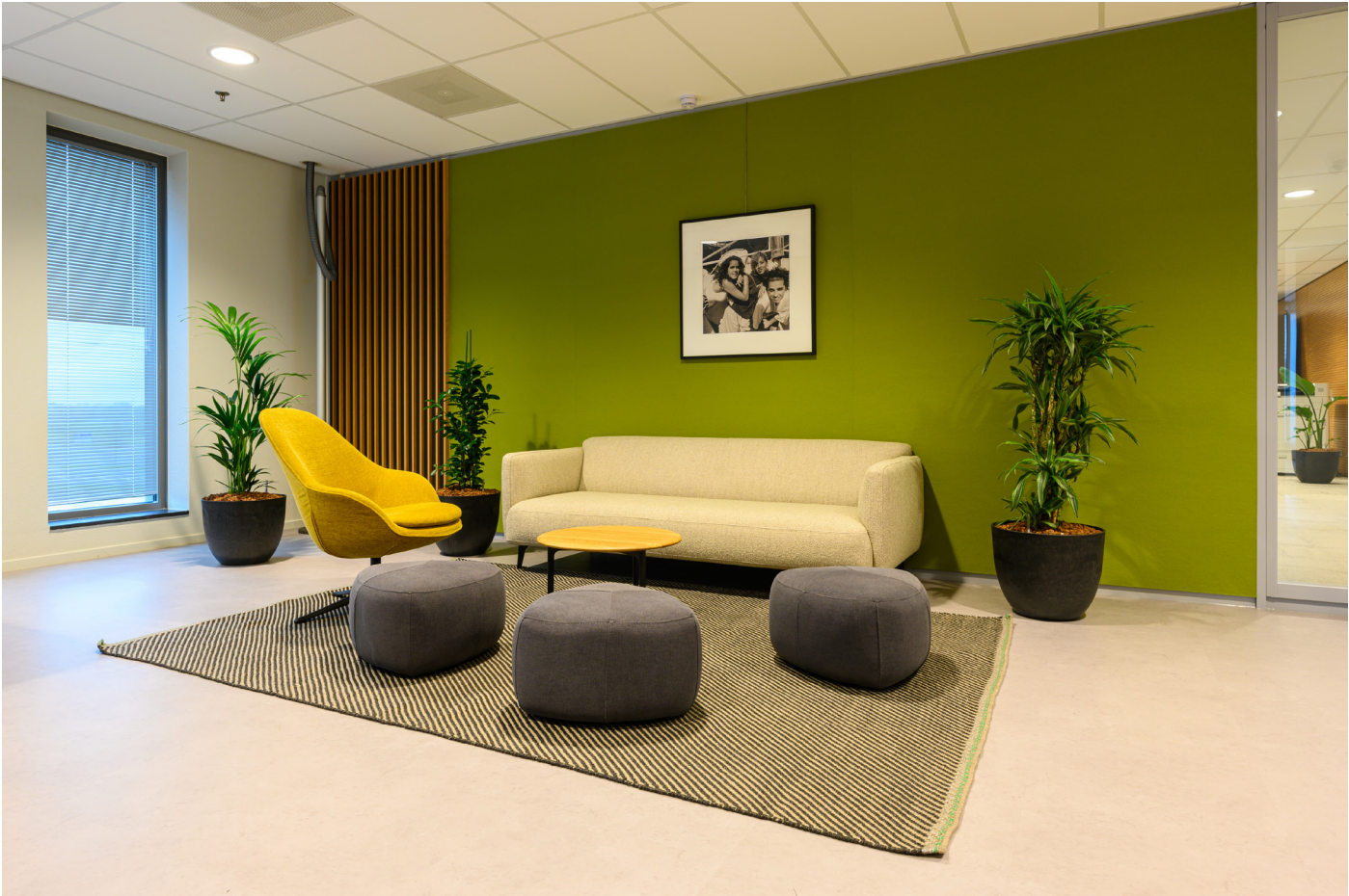
Spaces with a hushed ambience take inspiration from the hospitality sector.