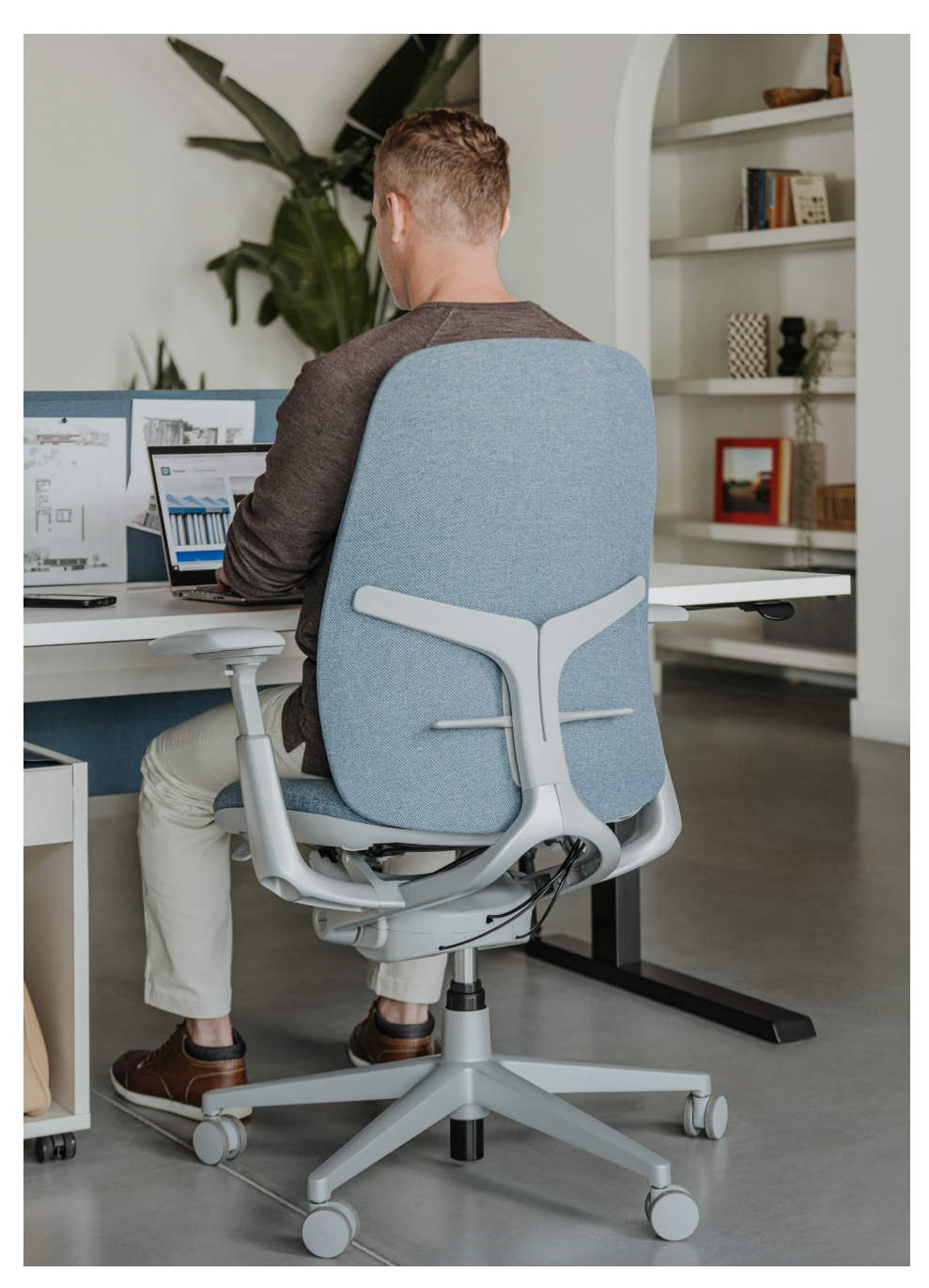
Zody LX Right-Side Controls