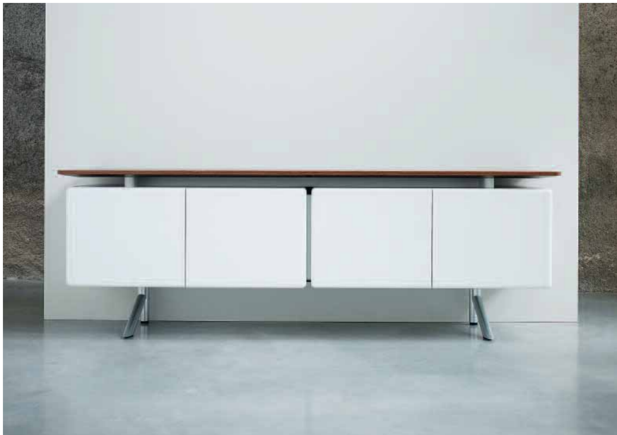
Sideboard – More than a storage solution, the sideboard is a personal and refined creation that humanises the professional atmosphere.