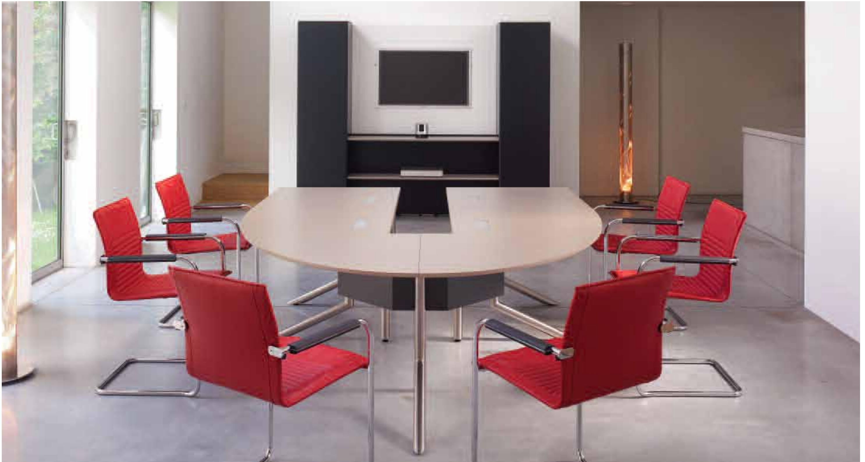
Videoconference – Bringing people together across challenging distances. Reducing business travel's impact on the environment.