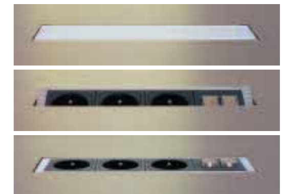
Rotating power socket