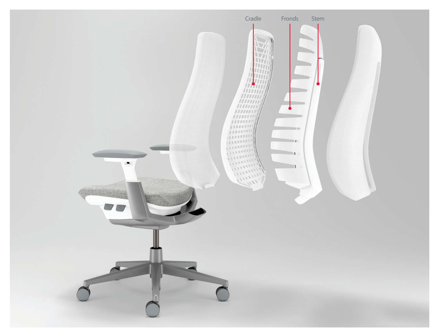
Fern's Wave Suspension™ system is the heart of the chair and the key to its back comfort and flexibility. From all appearances, the back looks simple, but inside is a high level of science, engineering, and innovation.