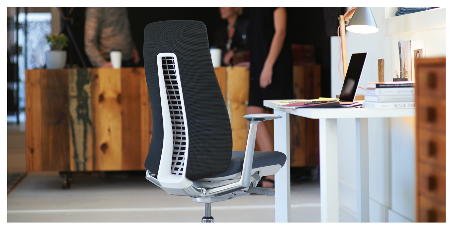
Fern offers a full complement of ergonomic adjustments that are easy to find, reach, and use. The ability to fine-tune for comfort and fit is especially important for longer-term, focused work.