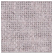
Soft Lavender 64-AAK