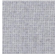
Feather Blue 64-AAE