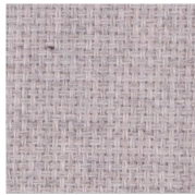
Soft Lavender 64-AAK