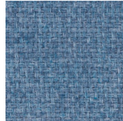
French Blue 4X-DCM