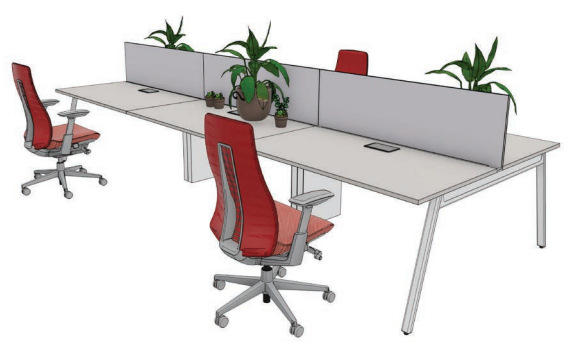
Office: Short Term