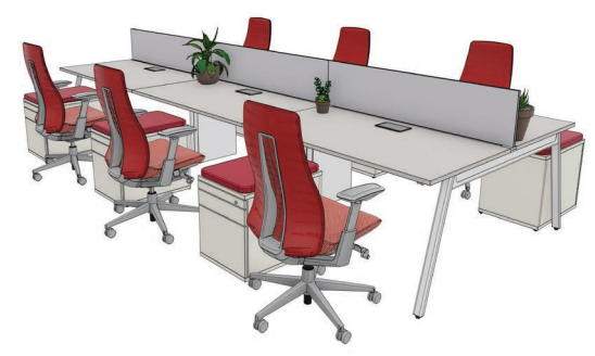
Office: Current State

We believe these changes will be adopted positively and organisations will be able to attract and retain talent with post-COVID19 workplace police.