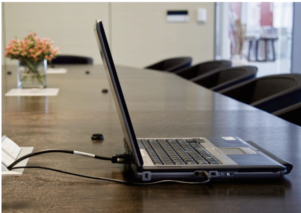
In conference rooms, members can seamlessly hook up their laptops to the system to give presentations on the plasma screens.

Some of the sustainability initiatives at One Haworth Center affect our members' well-being as well as the environment. For example, centralized print rooms require significantly fewer printers and have reduced paper consumption by more than 400,000 sheets in just six months. Even better, they ensure that emissions are contained — not released directly into work areas. A comprehensive wireless network lets members work wherever they're most comfortable. And fully equipped conferencing facilities mean our members don't have to carry their own technology from room to room.