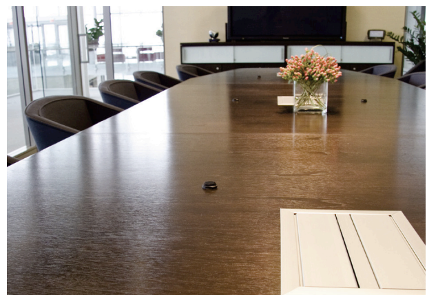
One Haworth Center's conference rooms have full technical capabilities, including ceiling or in-table microphones, audio/video conferencing and data power access in the table.

One Fact — One Haworth Center was awarded the 2008 Best Corporate Project Award from Pro AV magazine.