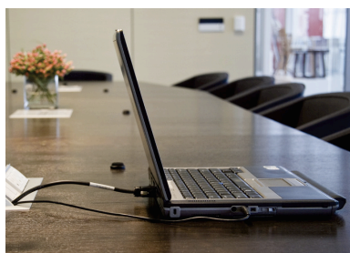
In conference rooms, members can seamlessly hook up their laptops to the system to give presentations on the plasma screens.

Some of the sustainability initiatives at One Haworth Center affect our members' well-being as well as the environment. For example, centralized print rooms require significantly fewer printers and have reduced paper consumption by more than 400,000 sheets in just six months. Even better, they ensure that emissions are contained — not released directly into work areas. A comprehensive wireless network lets members work wherever they're most comfortable. And fully equipped conferencing facilities mean our members don't have to carry their own technology from room to room.