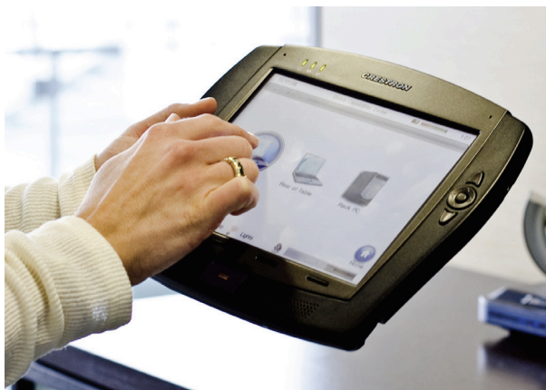
Crestron handheld devices are used to control audio and video equipment.