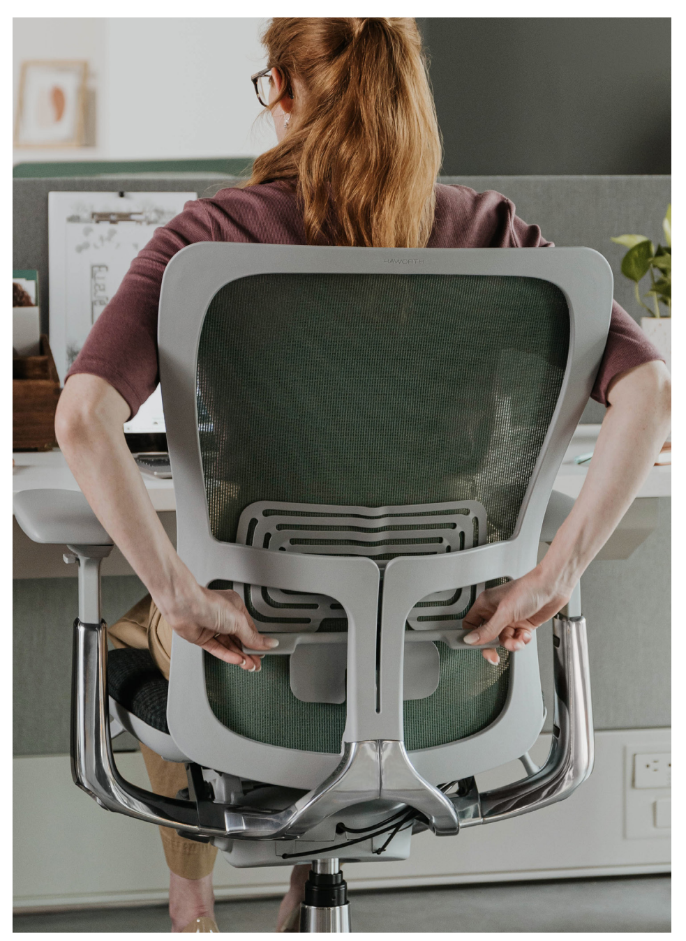
Zody II Left-Side & Back Controls